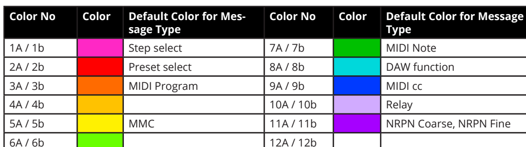
Chart 2 (A=full illumination, b=dimmed)