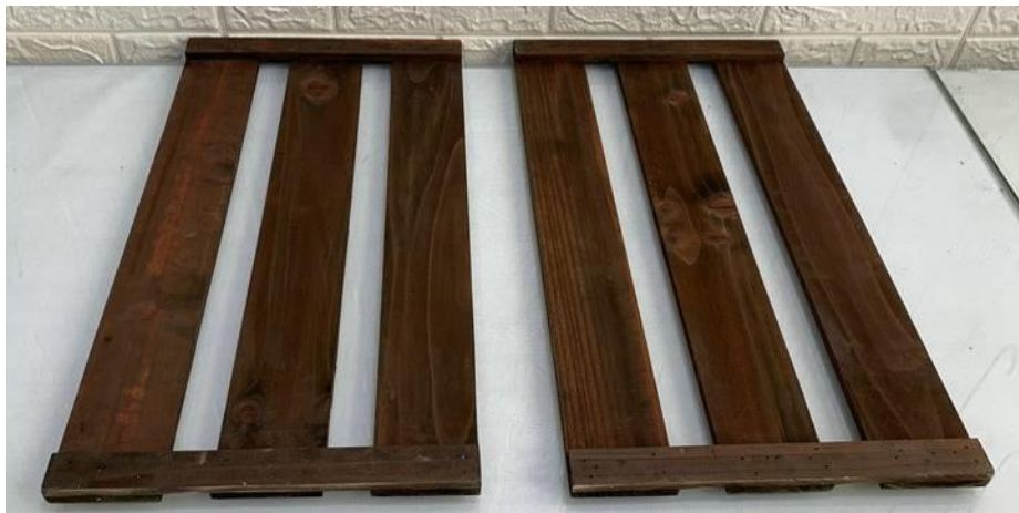
- 2x thin side walls