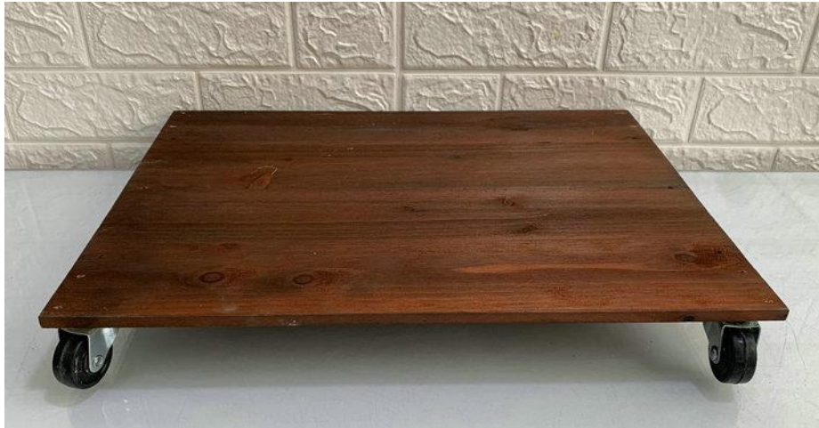
- Crate bottom with four wheels