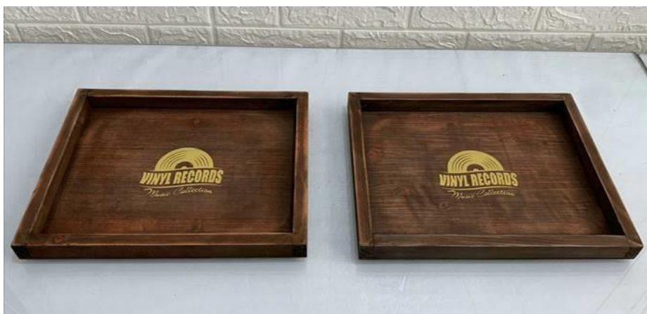
- 2x front wall and back wall